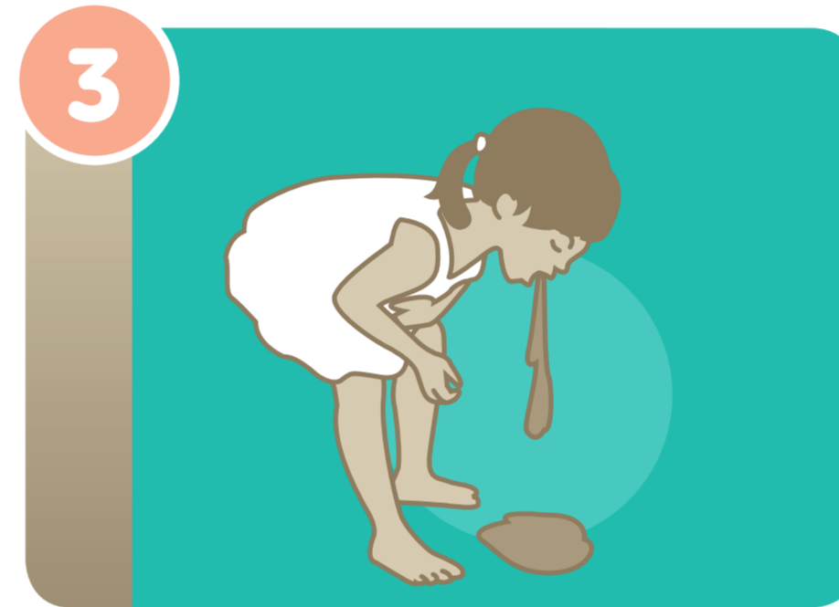
3 Umntwana uyaphalaza ukhupha yonke into akuhlali nto esiswini