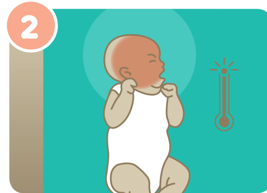
2 Umntwana ongaphantsi kwenyanga ezimbini Umntwana unomkhuhlane kwaye alutyi okanye aluncanci