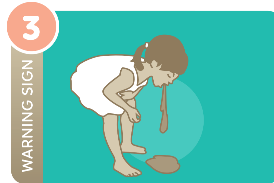
3 WARNING SIGN The child is vomiting everything